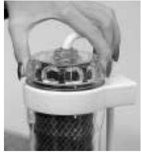
Figure 13 Disconnecting outlet tube